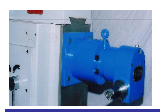
RACK CUTTING ATTACHMENT