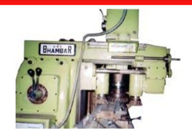
ANGLE CUTTING ATTACHMENT