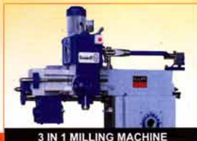
3 IN 1 MILLING MACHINE