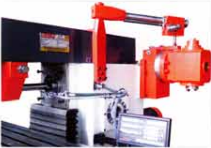
Vertical Attachment with Hanger & D.R.O.