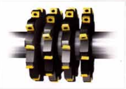
Efficient Cutting Capacity