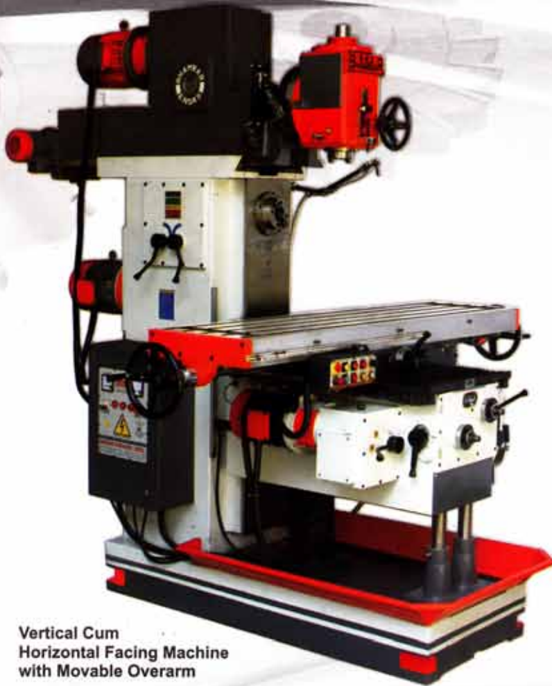
Vertical Cum Horizontal Facing Machine with Movable Overarm