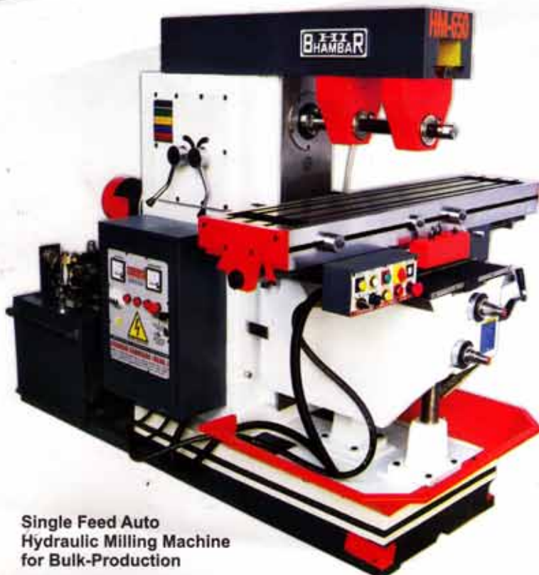
Single Feed Auto Hydraulic Milling Machine for Bulk-Production