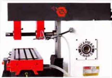
Robust Designed Headstock with Rigid Overarm, Arbor & Supports