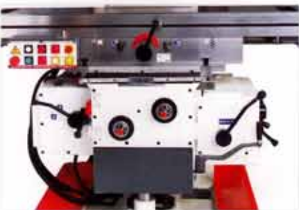
Distress Free Rapid - Feed Mechanism in XYZ Axis