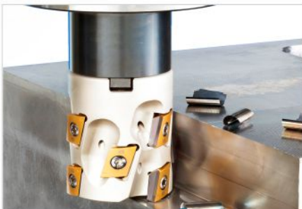
Efficient Cutting Capacity