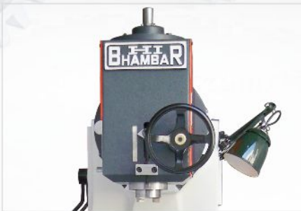
Robust Headstock Head Swivel \pm 90^\circ both side