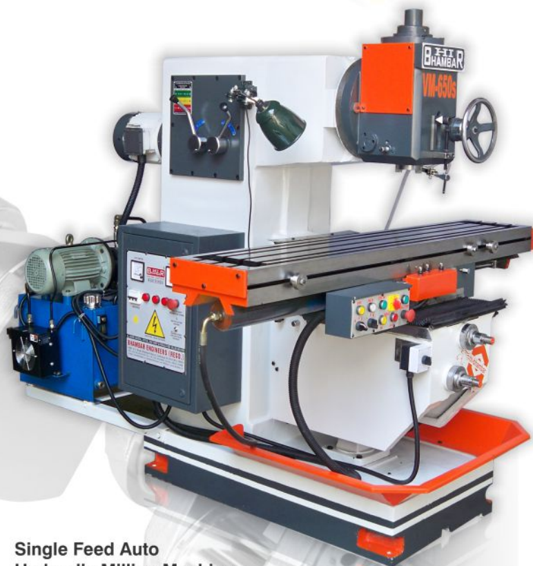
Single Feed Auto Hydraulic Milling Machine for High-Production